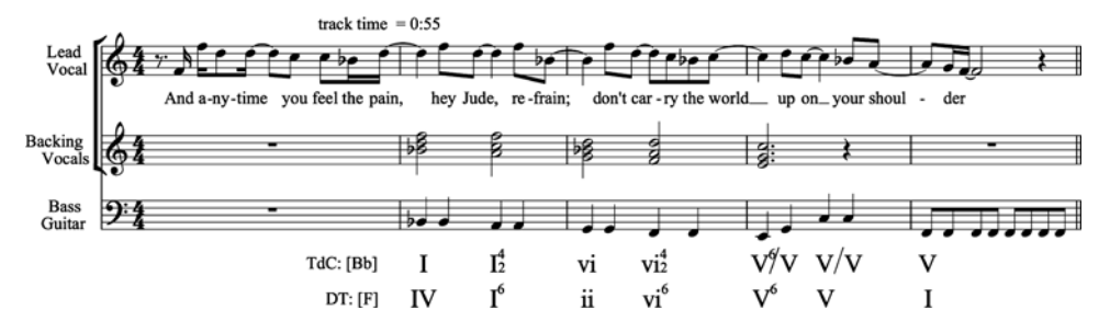
Example 1. Selected instruments from the beginning of the middle section in 'Hey Jude'. (Words and Music by John Lennon and Paul McCartney, Copyright © 1968 Sony/ATV Music Publishing LLC, Copyright Renewed, All Rights Administered by Sony/ATV Music Publishing LLC, 8 Music Square West, Nashville, TN 37203, International Copyright Secured, All Rights Reserved, Reprinted by permission of Hal Leonard Corporation)

Figure 1b shows DT's analysis of 'Hey Jude'. It is instructive to compare this to TdC's analysis in Figure 1a. Some differences are completely superficial; for example, both analyses define the opening five measures of the bridge section as a unit, but they use different labels for this unit ($A versus $BrP). Other differences are more significant; TdC hears the bridge as centred on Bb while DT does not posit any modulation away from the original key of F (see Example 1). As a result, the analyses generate