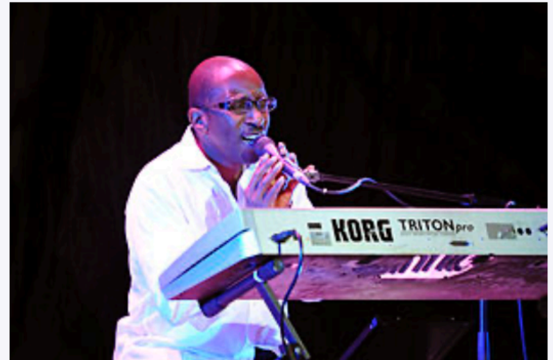
Phillinganes performing with Herbie Hancock in 2010